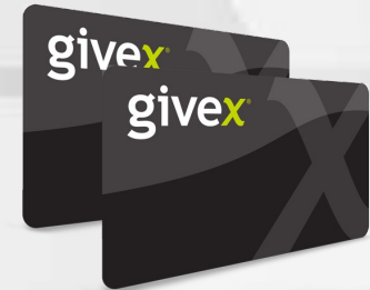
PAYMENTS Digital and in-store