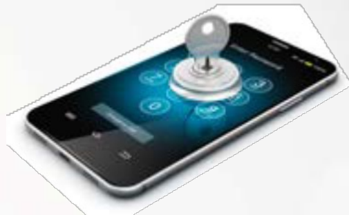
INTEGRATION 1,000+ APIs