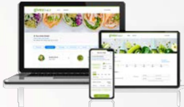
ENGAGEMENT Gift card and loyalty