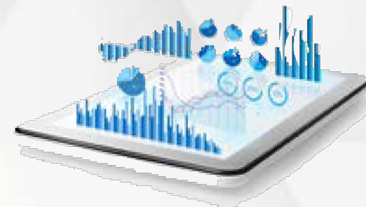
ANALYTICS Extensive and real-time