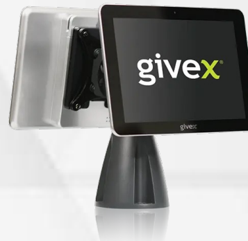
POINT-OF-SALE Cloud-based and secure